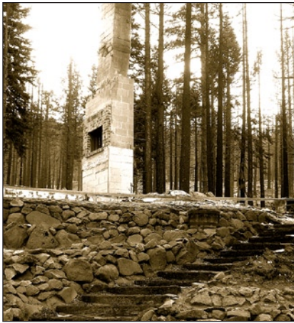
Her Tahoe home.

Through this experience, I learned how everything can change in minutes: Treasured